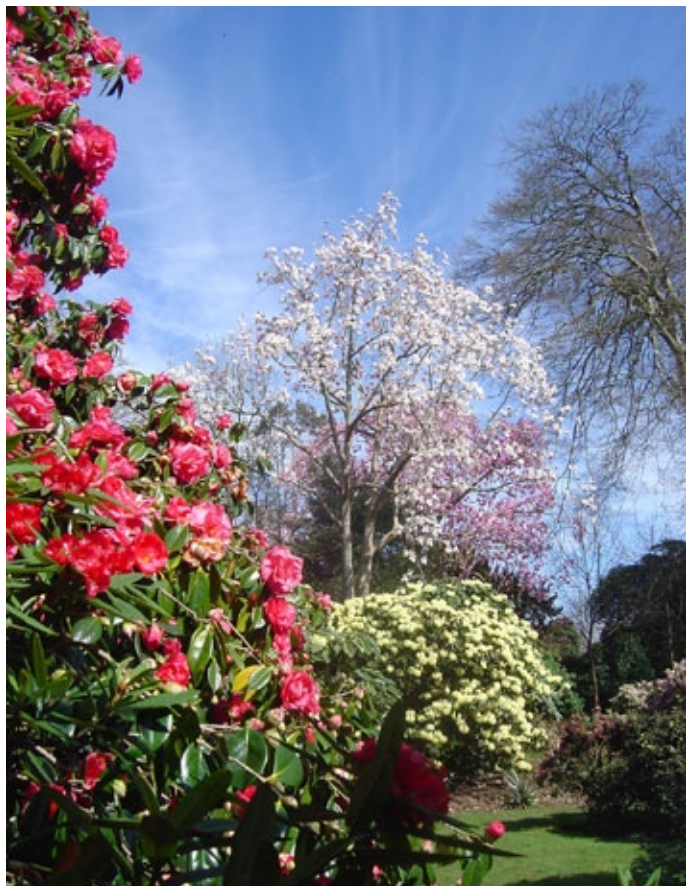
C. japonica 'Drama Girl' and a view of the gardens.