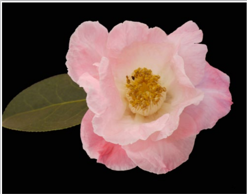
C. 'Blissful Dawn'