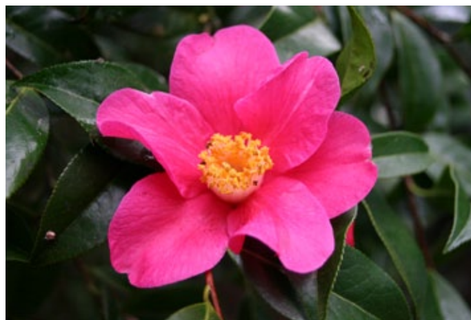
Camellia saluenensis 'Trewithen Red'