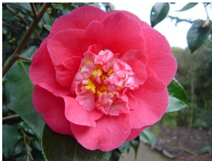
Camellia japonica 'R.L.Wheeler' See 'Camellias at Trewithen' on page 4.

I was not aware of this consultation document until it was recently brought to my attention by an eminent member of the horticultural trade and rhododendron enthusiast. If you use peat or peat based products in your garden, I request you take the time to review the DEFRA documents and write to me with your opinions, I will then attempt to make representations on behalf of the group either directly with DEFRA or more likely through RHS channels. My personal opinion of the consultation paper itself is that it is potentially confused and confusing; its position with respect to the destruction of habitat and the release of greenhouse gases seem focussed at the national level when the issues need to be considered at the European or global level, indeed I cannot recall the last time I saw English peat for sale in a