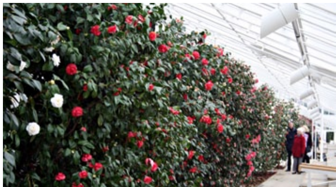
Inside the 300 feet long conservatory

Few enthusiasts for camellias can have missed the wide publicity (incl. a two page spread in the Daily Telegraph on 19th February) for the restored Camellia Glasshouse and the 34 varieties of Camellia dating from the 1790's onwards. The £12m restorations of the Conservatory and gardens were completed last summer. I had the pleasure in visiting the gardens and the glasshouse on 3rd March this year. The collection in the Camellia House, up to 9 or 10 feet tall, were nearly all in full bloom, a fantastic sight and not a sign of the previous sooty mould or scale. They are mainly C19th japonica varieties with just one reticulata – 'Captain Rawes'. The 'Camellia Festival' is a sight worth travelling to see – the manned entry to the 'Festival' is only open until 20th March – but I am assured that after a two week closure, it will be open to all visitors from the 2nd April. Congratulations to Jane Callander, Herb Short, the late Marigold Assinder and members and the officers of the ICS for all their efforts to save this historic collection for the future.