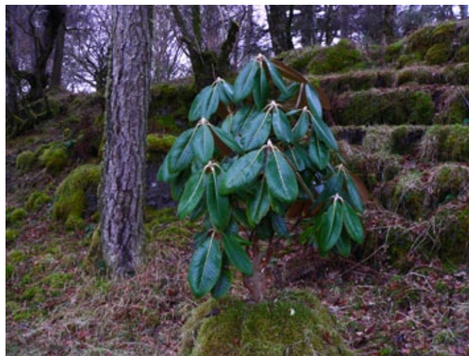
R. suoilenhense December 2010

Two years ago in the late winter, I took pity on all the rare and good plants in the wild garden which were not doing well, and in one trailer load, I dug up the sine nomine . I decided that as it did not appreciate the spot I had given it, I would offer it the opposite, and moved it into heavy cover and planted it, if that is the description, placed it on top of a Noble Fir stump, two feet off the ground, and at least two feet across, and covered the root ball with loads of sphagnum moss, it grows 10" deep in places here, and nothing else. It would be the ultimate make or break site.