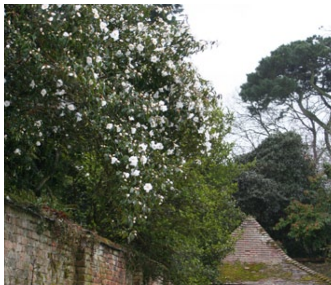
Camellia cuspidata var. cuspidata