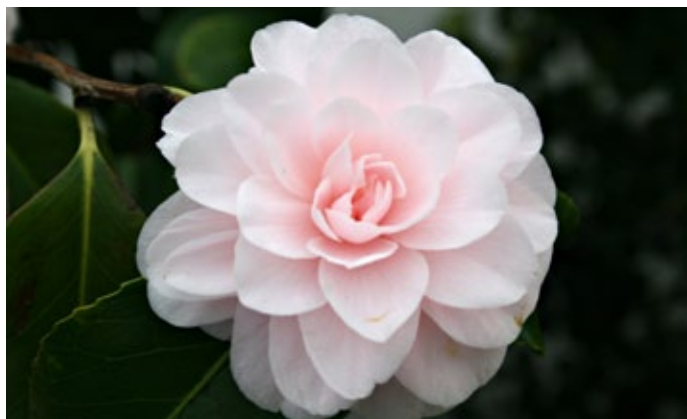
Camellia japonica 'Incarnata'. Imported from China in 1806.