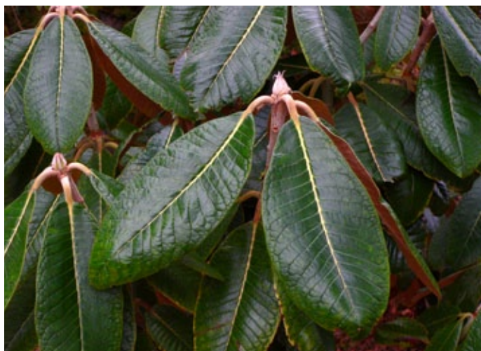
The healthy leaves and buds

In one year the plant doubled in size, the leaves looking really fit and healthy, and it obviously loved the shelter, drainage and daily chat as I walked past it when walking round the garden with the hounds! I feared a deer would dislodge it from its resting place, for it was only resting on the stump top. I decided that it had to take its chance for water, deer and tree-borne diseases. There is so much fallen timber all about that honey fungus is, despite one's horror of it, part of the growing medium! The rainfall is another word which features on the negative side of the list.