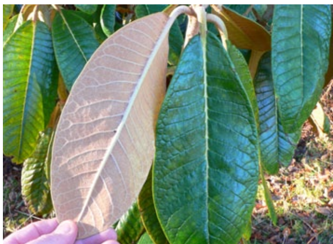
R. suoilenhense – The leaves and indumentum.

I used to experience the same when I lived over at Ardanaisig, no longer the garden it once was, where the rainfall was regularly at least 100" and the rhododendrons magnificent. Leaching of nutrients is a problem with such rainfall, and although the plants there were growing in what became great peat islands, with large open cuttings/drains running between the plants at the worst and boggiest places, they luxuriated in such conditions.