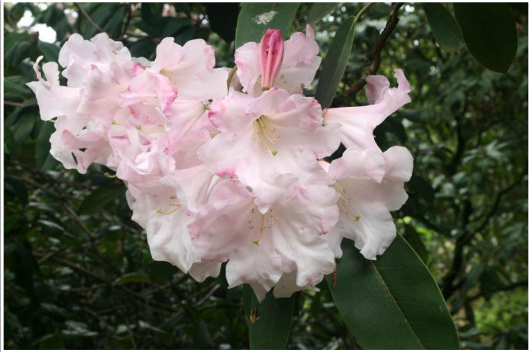
R. 'Naomi Stella Maris'