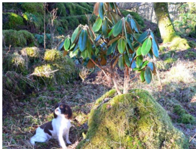
The root ball on the Noble Fir stump.

So if this is the Vietnamese plant, it is a tough one, given cover of trees. Huge 250 year old Noble Firs surround its little clearing, a rock face one side, little wind buffeting where it is - although it had it until two years ago - and excellent drainage.