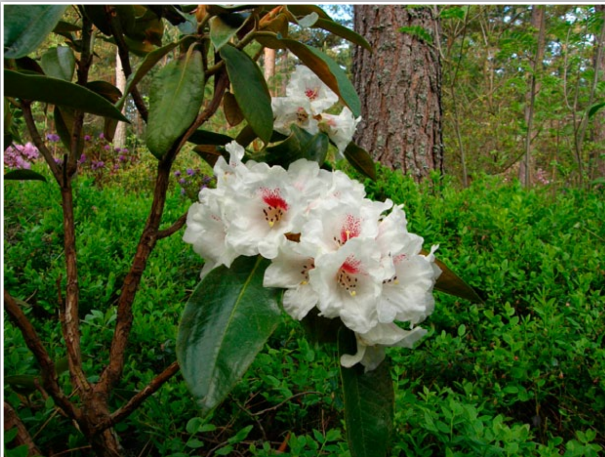
R. faberi ssp. prattii